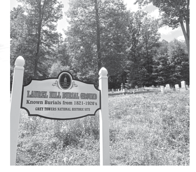
Public is welcome dawn to dusk.

Another important component of the work plan is interpretation and public information. This has included development of interpretive materials and interpretive programs and development and installation of signage and wayside exhibits.